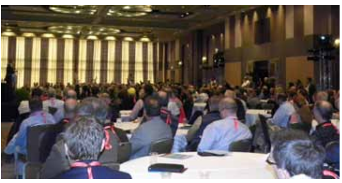
Members gather during the 2011 SIOR Fall World Conference Closing General Session in Chicago